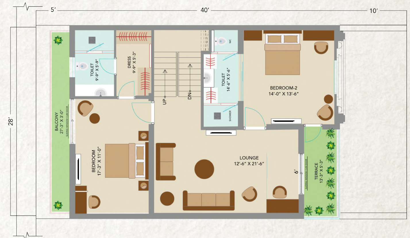
COLONIAL BUNGALOW GRANDE: FIRST FLOOR